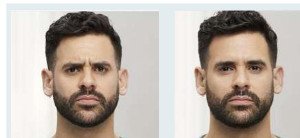
Before - After